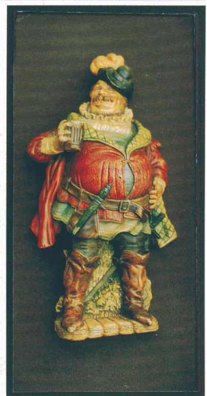
FALSTAFF 12" X 9"