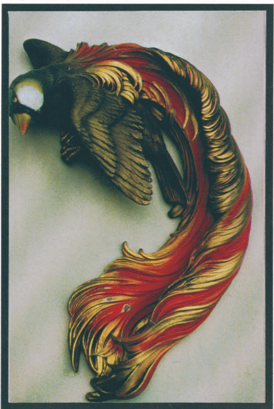
BIRD OF PARADISE 18" x 12

The bird of Paradise picture plaque measures 18" high x 12" wide modelled by Mr Fred Wright in 1973. Painted in gold, red and black colours.